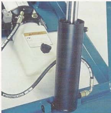
New single acting cylinder with flow limiting valve provides safe gravity-down operation