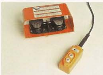
Heavy-duty, NEMA 12 hand control for safe, convenient lift operation - Shown with optional foot control