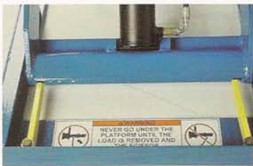
Hinged maintenance catches for convenience and added safety