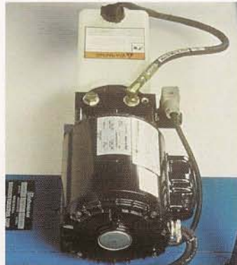
New 115 volt unitized power unit eliminates previous duty cycle restrictions