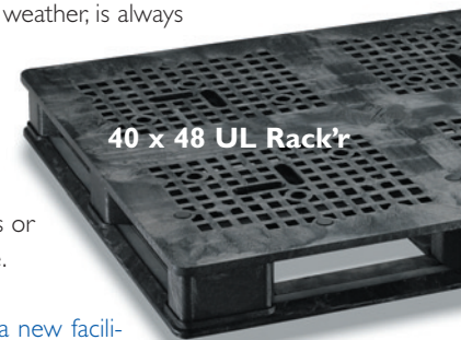
40 x 48 UL Rack'r

Reusable packaging can reduce CASUALTY INSURANCE, through reduced lacerations, strains, sprains and slivers. PROPERTY INSURANCE, covering fire, flood, wind and weather, is always subject to change with changes in commodity classification, facility attributes or storage practice.