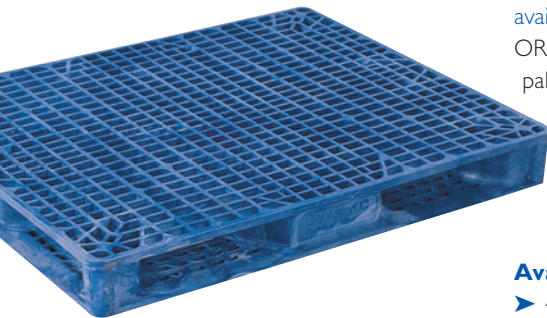
40 x 48 FM Structocell

ORBIS offers a family of 12 rackable and stackable pallets in footprints from 40" x 48" to 48" x 48". ORBIS offers approved pallets with the flame retardant characteristics without sacrificing performance characteristics.