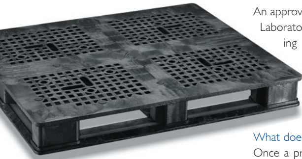
40 x 48 FM Rack'r