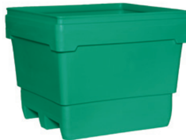
MB 2836 2-Way Molded-in Base