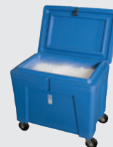
DRY ICE CONTAINERS