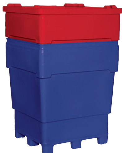
2956 4-Way Welded Base