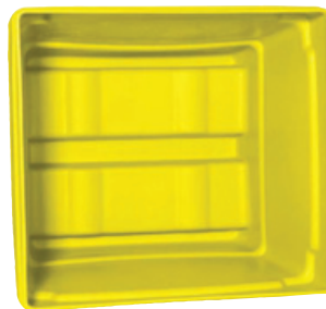
MB 2800 Inside View 2-Way Interior ribs support bottom