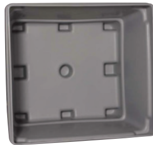
MB 2700 Inside View 4-Way