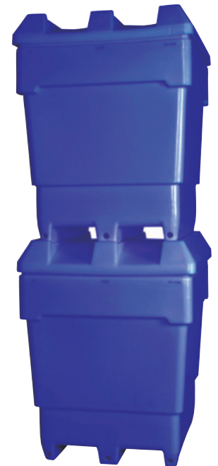
2800 Series MB with unique raised cover lid that allows for drainage and/or stacking in coolers and freezers