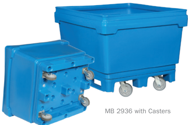
MB 2936 with Casters