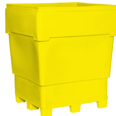
MB 2900 Welded Base