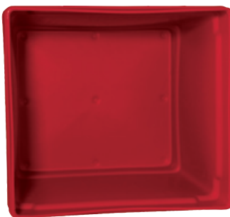
MB 2900 Inside view