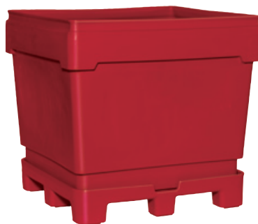
MB 2936 4-Way Socket Base