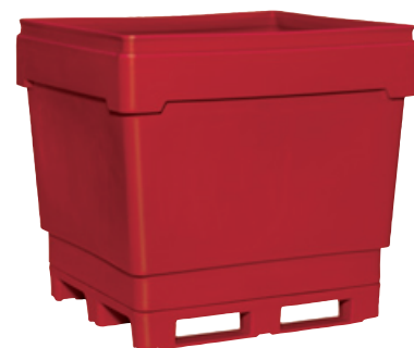
MB 2936 Roll Over Base

NOTE: Unless specified, all weights relate to box only. Dimensions and weights are +/- 2%. Standard colors for Bins are natural and gray. Optional colors available.