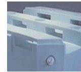
Easy Fork Access