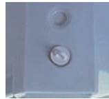
Drains with Plugs & Drain Plug Holders