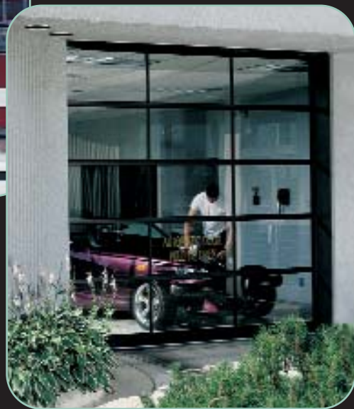
AlumaView STANDARD, bronze-anodized