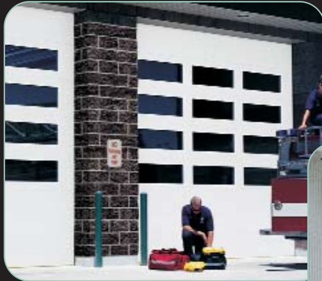
TriCore STANDARD, white, with full-view windows