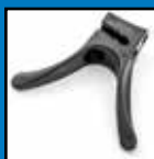
Y-clip P/N 35500078