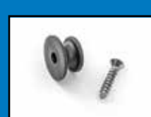
Nylon Knob & SS screw for securing rubber strap P/N 34100562