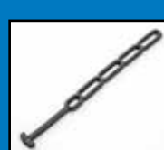
EPDM Rubber Strap (PB660/PB1000/ PB1800) P/N 33300041