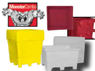
Single Wall Bins