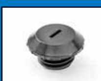
Nylon Wear Pads P/N 23000069