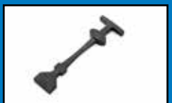
EPDM rubber "T" Strap (PB1545) P/N 35500079