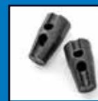
Black Adjustment Plugs P/N 34100563