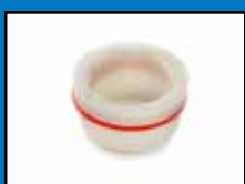
2" Adaptor (converts to 1.5" female NPT) P/N 34100566