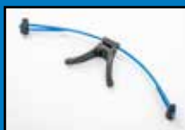
ASM Y-clip/Nylon Cord/ Adjustment plugs (PB2145) P/N 34702501