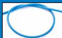
Nylon Cord P/N 33300043