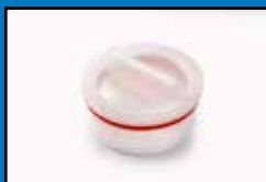
2" Drain plug & O ring P/N 34100561