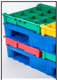
Berry Pallet is designed so when one pallet is on top of a pallet with trays the pallet touches the tray top evenly.