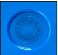
Molded-in date stamp provides date of manufacture.

Inprinting available on one or two sides, with optional name plate. Minimum order of (6) required. Contact us for details.