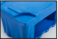
Stratis Deck-Lok safety stacking feature allows empty pallets to stack empty without sliding.