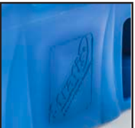
Molded-in nameplate for customer logo.

Inprinting available on one or two sides, with optional name plate. Minimum order of (6) required. Contact us for details.