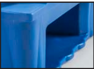
Forklift safety straps connect the legs and have scallops on the bottom to extend the effective area of safety.