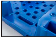
Molded-in ergonomic under deck hand holds.