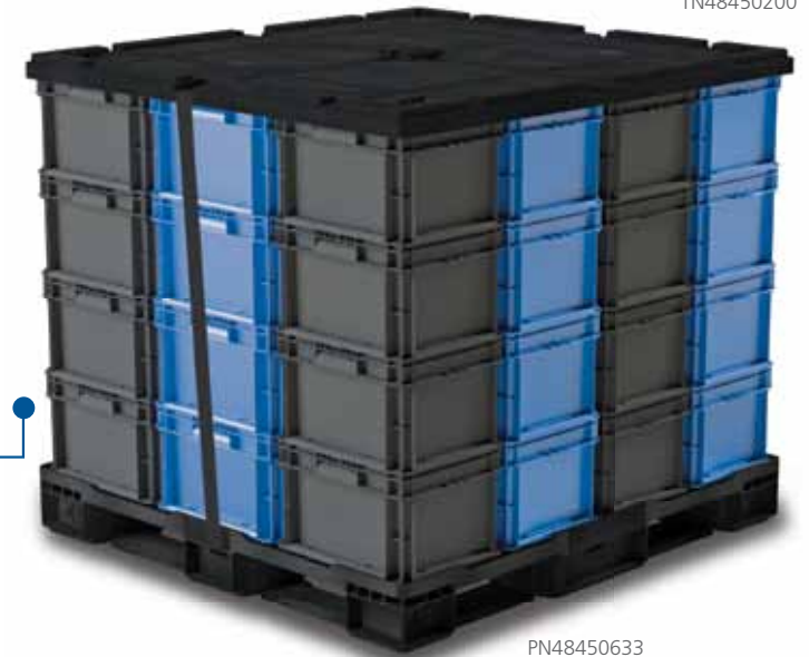
Optimum Configuration Containers cube 48" x 45" pallets