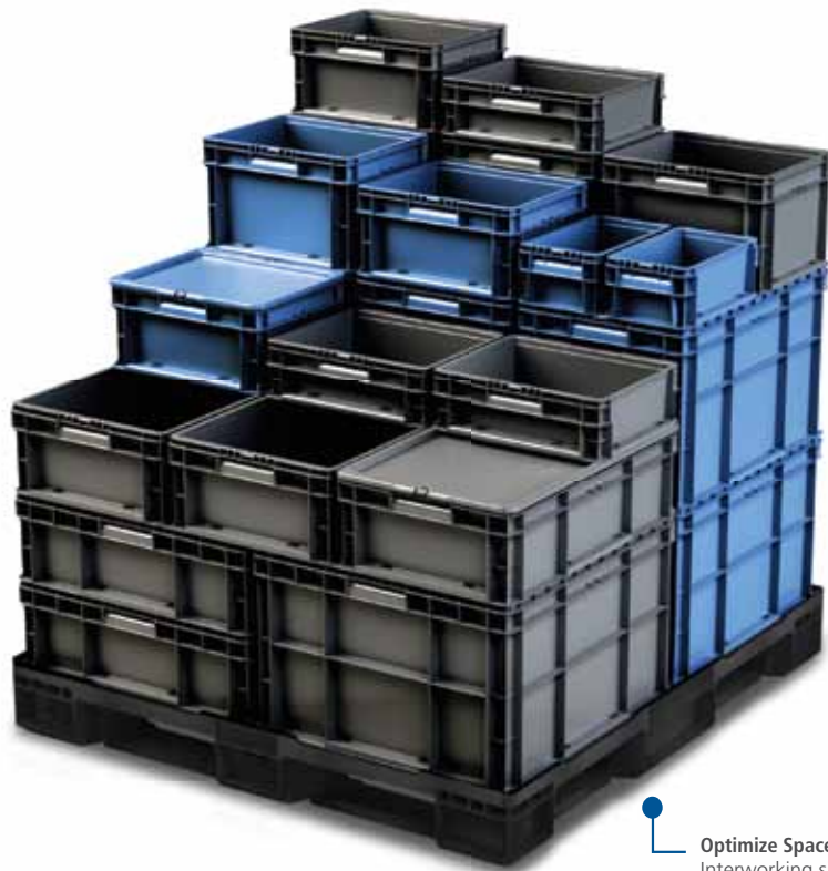
Optimize Space Interworking sizes allow mixed stacking on a pallet