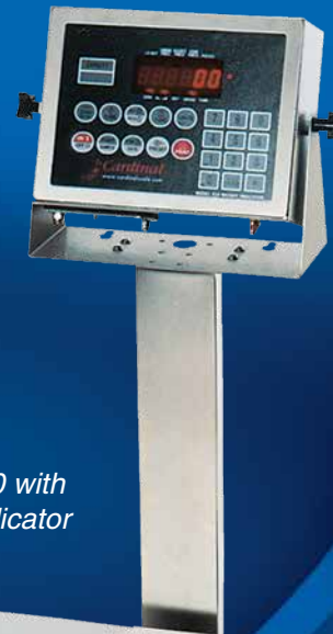
EB-300 with 210 Indicator