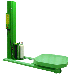
Photo eye and top and bottom wrap counters increase productivity and efficiency.