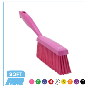
4587x Fine-Particle Bench Brush