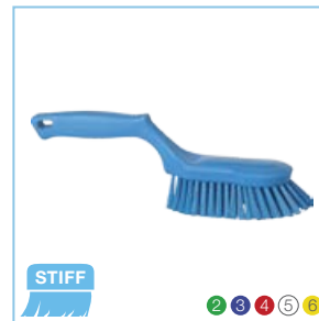
4169x Raised-Handle Scrubbing Brush