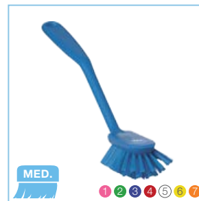
4237x Dish Brush with Scraper