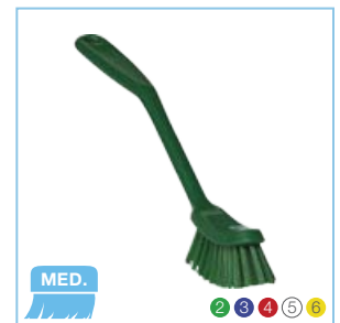
4287x Narrow Dish Brush