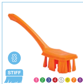
4196x UST Long-Handled Hand Brush