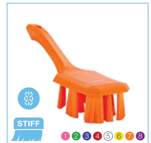
4179x UST Short-Handled Hand Brush