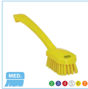
3088x Utility Brush