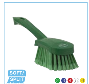
4194x Short-Handled Washing Brush