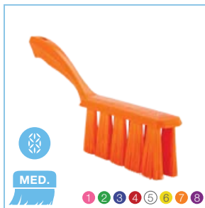
4585x UST Medium Bench Brush