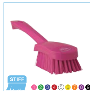
4192x Short-Handled Scrubbing Brush