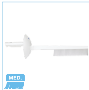
41845 Brush with Hand Guard