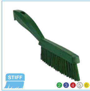
4195x Narrow Hand Brush