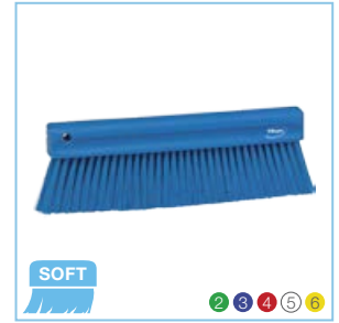
4582x Fine-Particle Counter Brush