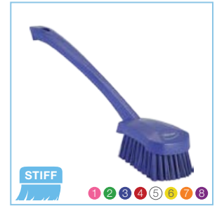
4186x Heavy-Duty Long-Handled Hand Brush