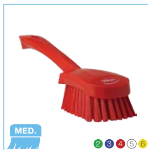
4190x Short-Handled Brush