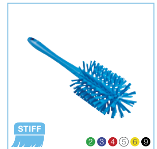
5381-90-x Bottle Brush