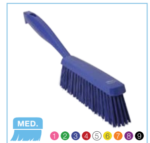
4589x Large-Particle Bench Brush