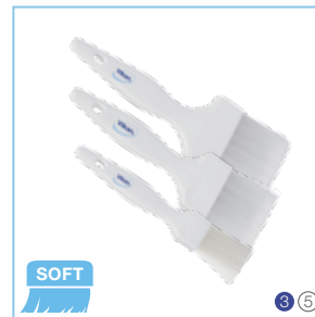
555030x, 555050x, 555070x Pastry Brushes