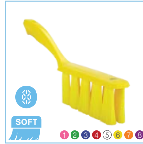
4581x UST Soft Bench Brush