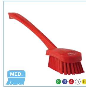
4182x Long-Handled Scrubbing Brush