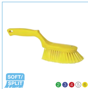
4167x Raised-Handle Washing Brush