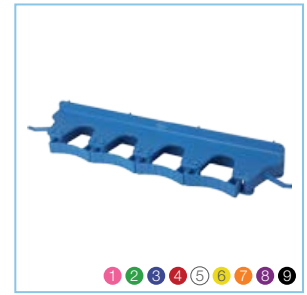
1018x Wall Bracket for 4-6 Tools