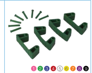
1019x Wall Bracket Replacement Clips