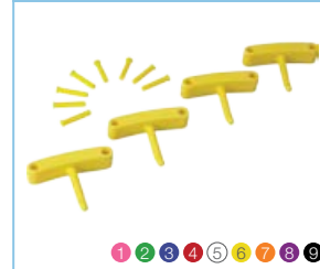
1016x Wall Bracket Replacement Hooks