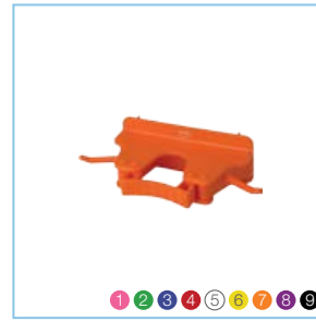
1017x Wall Bracket for 1-3 Tools