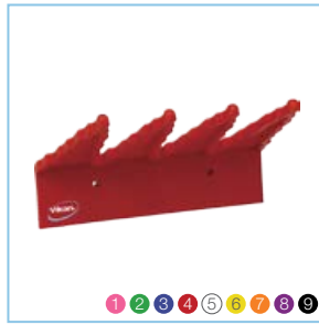
0615x Basic Wall Bracket