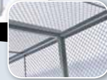
WOVEN WIRE MESH