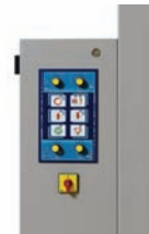
Programmable Control Panel