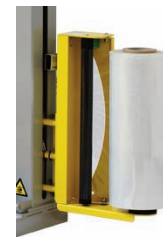
FM Spool Film Carriage

INCREASING YOUR PRODUCTIVITY DACO MATERIAL HANDLING & PACKAGING SOLUTIONS www.DACOcorp.com 800-345-3226