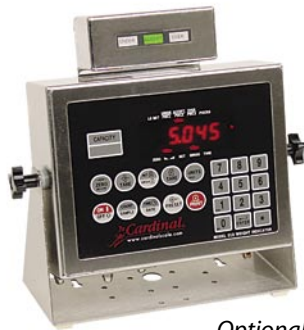
Optional Checkweigher Light Bar for Model 210