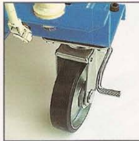
Dual-Action Caster Brake Locks Wheel and Swivel