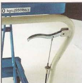
Convenient Hand-Lever Lowering Control For Model BX