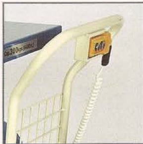
Removable Pendant Push-Button Control in Handle Mount (BXB)