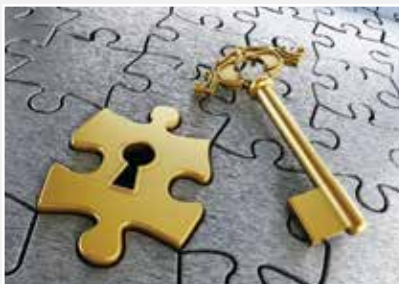
Turnkey Material Handling & Storage Systems