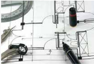
Project Planning, Engineering & Design Layout

DESIGN, ENGINEERING, SALES AND INSTALLATION SERVICES