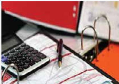
Data Driven Solutions