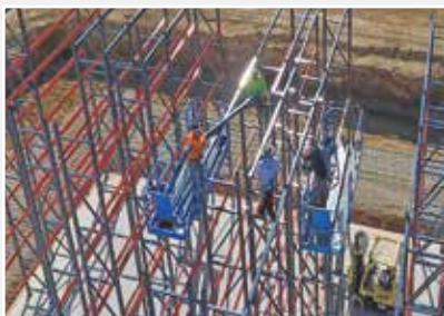
Installation and Permitting