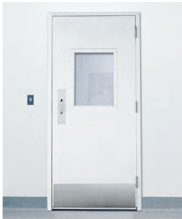
Shown with optional kickplate and vision panel.

Innovative Design. Superior Performance. Exceptional Value.