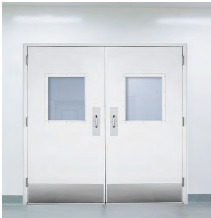
Shown with optional kickplates and vision panels.

Innovative Design. Superior Performance. Exceptional Value.