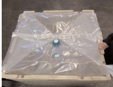
Tear the perforated flap on each corner of the form-fit liner.