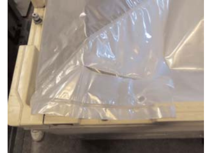
Close up of the torn perforated flap.