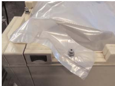
Attach the perforated flap to the locking post on the Caliber bin.