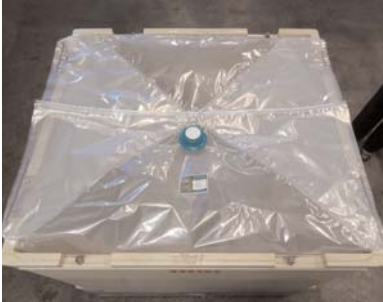
View of a filled form-fit liner in the Caliber bin.

Below are instructions for proper attachment of a CDF form-fit liner to a Caliber bin.