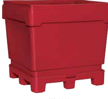
4-Way Socket Base