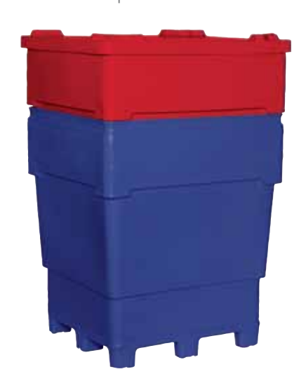
4-Way Welded Base

Welded and sealed base. Spin welds seal base from water. No exposed hardware.