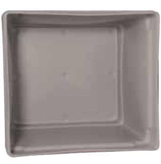
MB 2900 Inside view