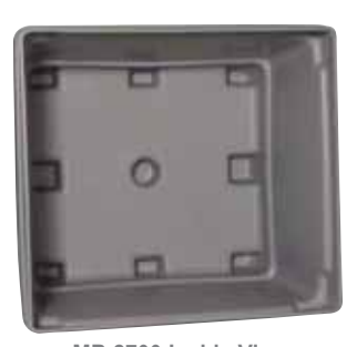
MB 2700 Inside View 4-Way

* Bases can be welded for sanitary purposes