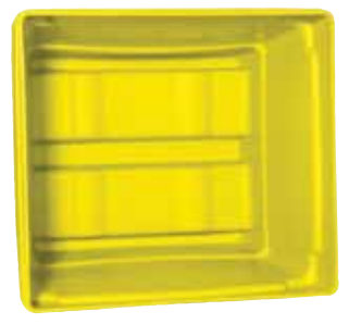
MB 2800 Inside View 2-Way Interior ribs support bottom