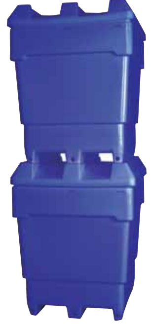
2800 Series MB with unique raised cover lid that allows for drainage and/or stacking in coolers and freezers