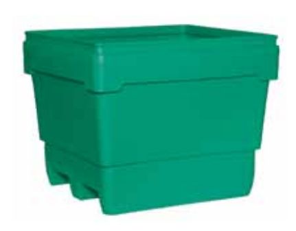
MB 2836 2-Way Molded-in Base