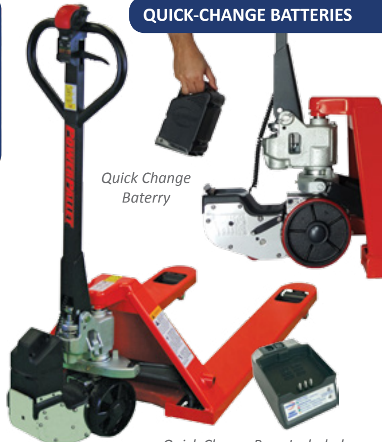
Quick Change Battery