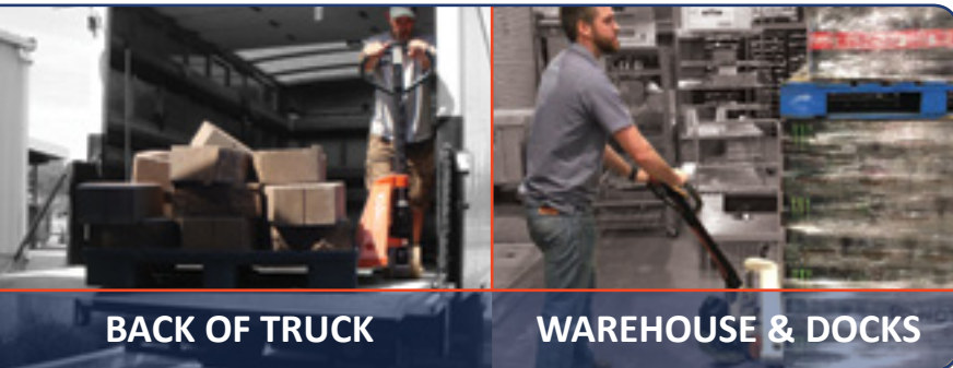
BACK OF TRUCK

The patented design of the PowerPallet 2000 locates the drive wheel within a spring loaded drive arm. A max of 350lbs is born by the drive wheel ( enough load transfer for reliable traction ), while all additional weight is born by the steering wheels of the jack. This results in less effort maneuvering at low speeds.