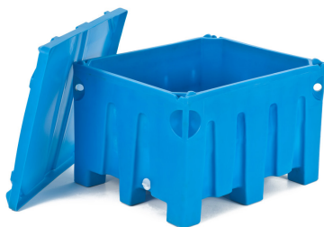
Shown with Optional Lid & Drain