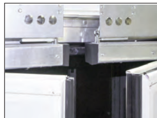
OPTIONAL BREAKAWAY PANEL