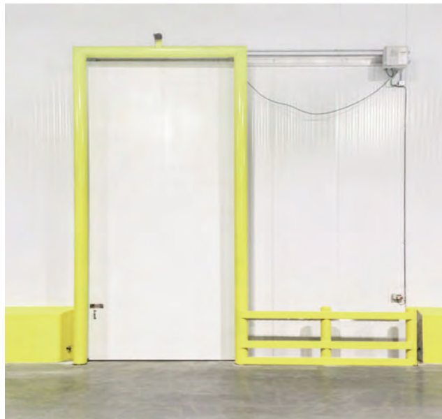
Shown with power operator.

Designed for high cycle operation, every aspect of the XP door was engineered to eliminate maintenance and downtime. The entire door system requires no lubrication and has no metal-to-metal contact eliminating wearing surfaces. The door's gasket design, no wood construction, simple quick connect heat, and one-piece gasket system, virtually eliminates maintenance.