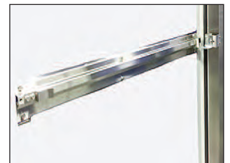
OPTIONAL BREAKAWAY WALL TRACK

THE LEADER IN COLD STORAGE DOOR INNOVATION