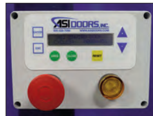
REMOTE DIGITAL DISPLAY