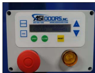
REMOTE DIGITAL DISPLAY