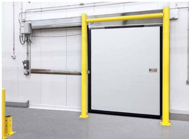
Shown with power operator.

Innovative Design. Superior Quality. Exceptional Value.