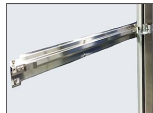
STANDARD BREAKAWAY WALL TRACK