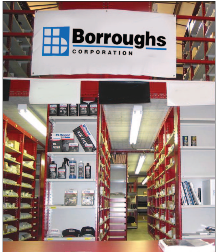
Originally designed for automotive parts departments, Flexi-Bins are sturdy enough to support a second level.

Available in your choice of seven colors. Flexi-Bin® backs are 445 White.