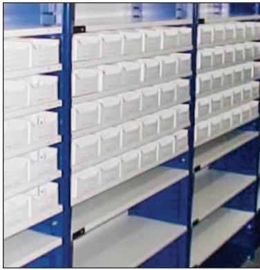
Available Flexi-Bin drawers (dividers optional) are equipped with a backstop that prevents accidental removal.