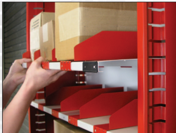
Add or remove slide-in shelves. Shelves adjust on 1-1/2" increments and lock in place automatically.