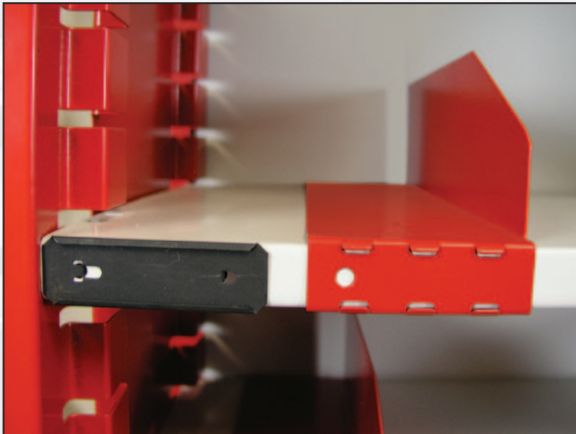
Sliding dividers create shelf compartments perfectly sized for your inventory. The patented formed-in label holder travels with the divider when parts are rearranged.

Take control of inventory organization and access in a way you never thought possible with economical Flexi-Bins® storage solutions. Flexi-Bins® easily adjustable sliding dividers and modular design allows you access to small parts and storage items instantly and easily. Sliding dividers adjust horizontally, and self-locking shelves can be raised and lowered without disturbing shelf contents for even greater time saving convenience. Efficiently organize and store items ranging from electrical components, small parts, tools and hardware to literature, binders and small boxes. Flexi-Bins® standard white back panels improve picking visibility and efficiency. Optional trim panels are available for a finished appearance. Install Flexi-Bins® as stand alone units or in back-to-back rows. Today, Flexi-Bins® are a favorite among auto parts stores, distribution outlets and retail operations. For improved inventory control and organization it's impossible to beat the functionality and value of Flexi-Bins®.