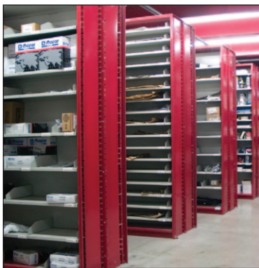
Rows of back to back Flexi-Bins create a highly efficient parts department.