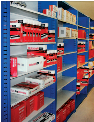
Automotive parts are stored properly in Flexi-Bins, catalog #FB101.