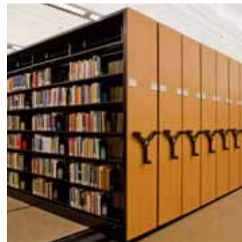
Duquesne University Gumberg Library