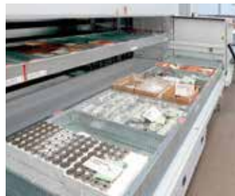
DUAL EXTERNAL DELIVERY