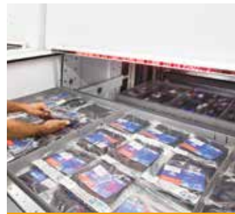
Alphanumeric LED Bar