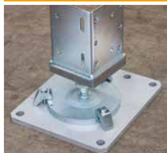
Weight Distribution Plates