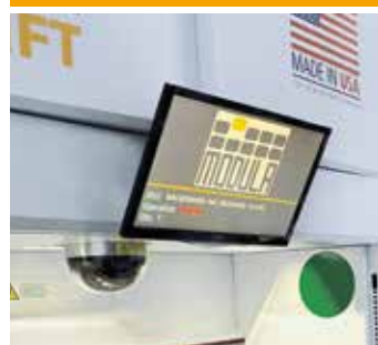
External Picking Monitor