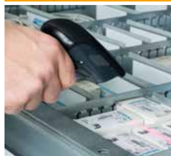
Bar Code Reader