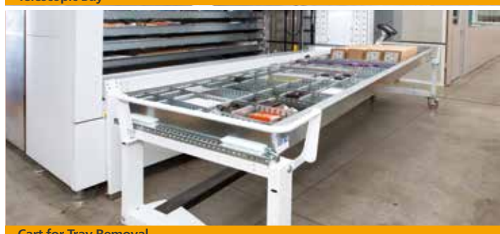
Cart for Tray Removal