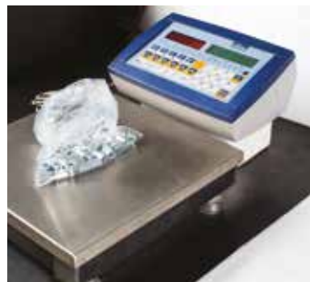
Piece Counting Scale