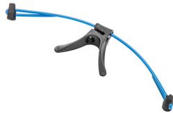
34702501 Y-Clip/Nylon Cord/ Adjustment Plugs