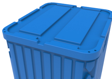
NEW Stackable Lid option available on both PB1545 & PB2145