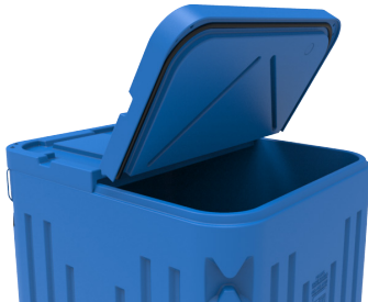
NEW Split-Lid option available on both PB1545 & PB2145