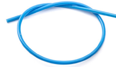
33300043 Nylon Cord