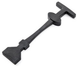
35500079 EPDM Rubber T Strap