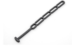
33300041 EPDM Rubber Strap