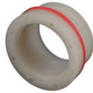
34100566 2" Male, 1.5" Female NPT Adapter