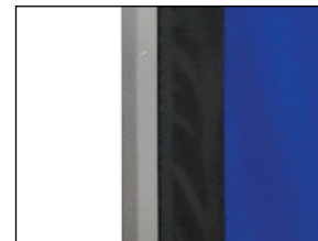
Optional Side guide Cover The ultimate in cleanliness, and provides streamlined appearance.