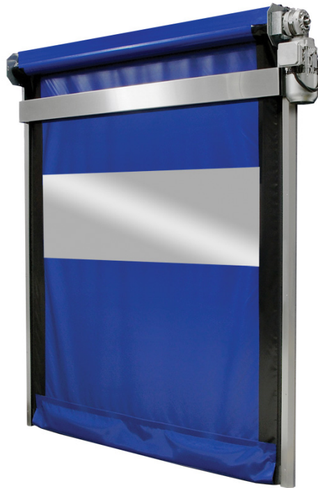
Shown with optional side covers and full vision panel

Superior aesthetics, uncompromising quality, exceptional reliability and unmatched value define the 515 doors. Designed from the ground up to far exceed the offerings of other door manufacturers, yet priced to meet demanding budget constraints, is truly the "no compromise" clean door solution.