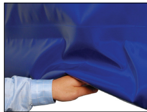
Soft Bottom Edge The ultimate safety for personnel and provides optimal sealing. Easy to clean.

WIC = Door Opening Width in Clear HIC = Door Opening Height in Clear