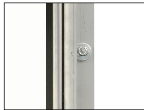
Ultra Low Profile Door requires only 2-3/4" of side room clearance.