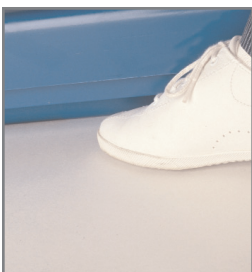
Full Perimeter Electric Toe guard