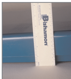
2.9" Lowered Height On Models Up To 1,100lbs