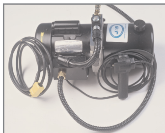
Remote Power Unit