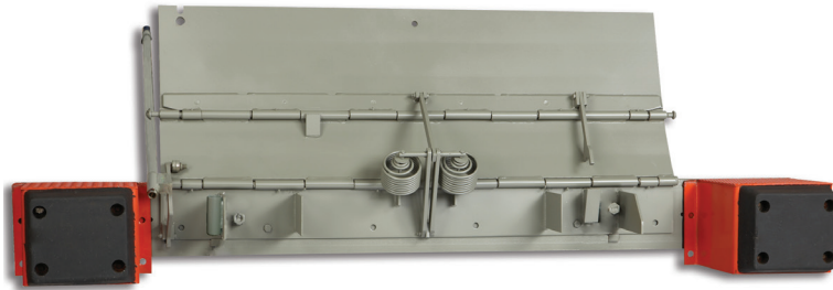
*Mechanical edge-of-dock leveler shown with heavy duty bumpers

When dock space is limited or the working range of a full size, pit-style leveler is not needed; NOVA's edge-of-dock levelers are an economical option. Edge-of-dock levelers mount to the dock face and provide a working range of 5 inches above and 5 inches below dock.