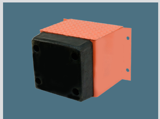
Heavy duty bumper blocks