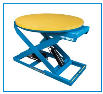
43" Diameter Turntable

480 VAC Motor w/Low Voltage Controls (L3K & L5K only)