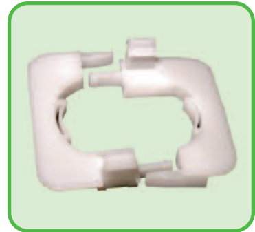
IC-9056 CDF Gland Adapter