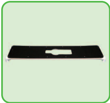
IC-9022 PVC Universal Fill Bridge