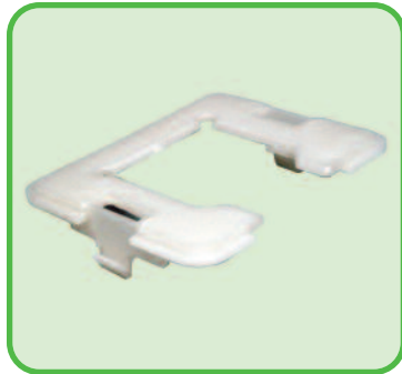
IC-9012 2" Combo Clip