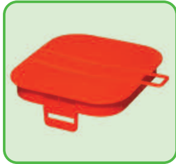
IC-9061 Tamper Evident Hatch Caps