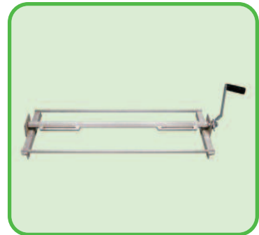
IC-9045 45" Winder System