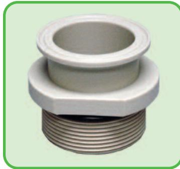
IC-9129 2" BSP Male / 2" Tri-Clamp Adapter

CDF warrants that its products will be free from defects in material and workmanship for one-hundred eighty (180) days after the date of delivery. Warranty claims must be made in writing no later than five (5) business days after the expiration of the warranty period. CDF's obligations under this warranty are limited solely to replacement of such products as are proven to be defective after CDF's inspection. Prior to use, the user shall independently determine the suitability of the products for the user's intended use and user assumes all risk and liability whatsoever in connection therewith.