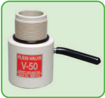
IC-2036 / IC-2037 V50 Valve / 2" BSP Adapter / Cutter Pusher