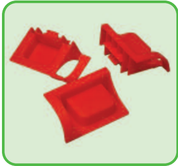
IC-9060 Red Lid Seal Clips (Kit)