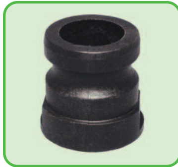
IC-9011 2" Butterfly Valve Cam Adapter