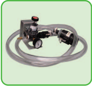
IC-9133 Air-Assist Venturi System