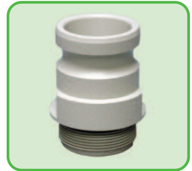
IC-9017 2" Male BSP / Cam Adapter