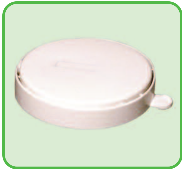
IC-2046 2" Push Lock Cap