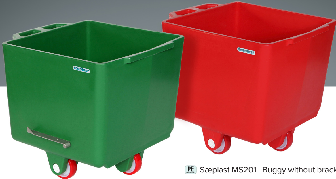
PE Saeplast MS201 Buggy without bracket