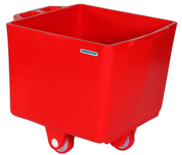
PE Sæplast MS201 Buggy without bracket

The versatile buggies are available in various colours enabling you to have dedicated buggies for different colour coded zones within your plant.