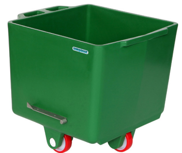
PE Sæplast MS200 Buggy with bracket