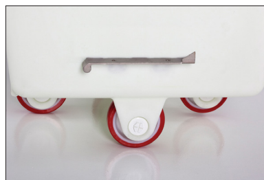
Integrated stainless steel brackets.